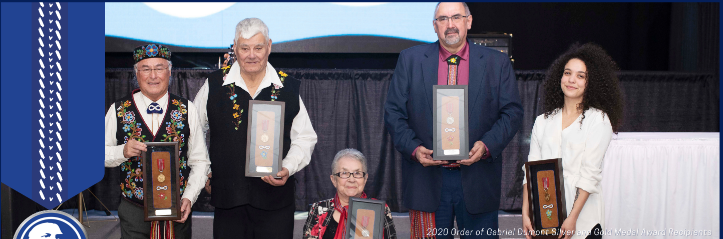
2020 Order of Gabriel Dumont Silver and Gold Medal Award Recipients

We as educators are proud of our Prince Albert Adult Basic Education (ABE) students as they continue to strive to achieve their educational goals, all while navigating through uncharted territories. In a time where it may have been easier to give up and try again when things are "better," they continue to push through and persevere. They portray hope and are a light during this journey of education and teaching in a pandemic. 🌍